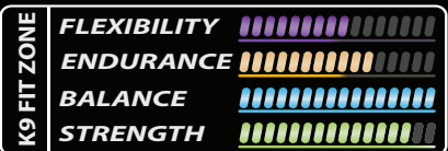
Used and Recommended by Professionals.